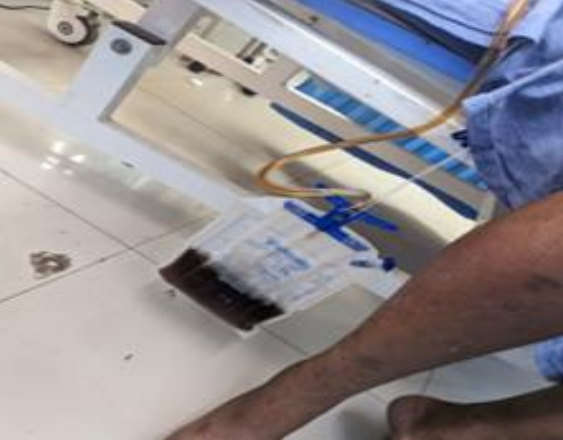
Figure 2: Patient's urobag showing hematuria