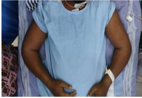
Figure 3: Bilateral upper limbs showing edema due to capillary leak