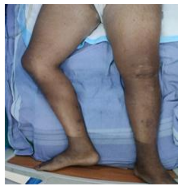
Figure 4: Bilateral lower limbs showing edema and blanchable rashes with petechia

Based on clinical examination, lab investigations, and other relevant investigations, a provisional diagnosis of viral polymyositis was made. Muscle biopsy showed inflammatory myositis overlap myopathy, mostly attributed to a viral aetiology. Further lab investigations showed hypoalbuminemia, raised haematocrit, elevated hemoglobin with raised serum potassium, and significant myoglobinuria. Persistent low blood pressure was managed with aggressive fluid therapy. The patient was diagnosed with viral polymyositis complicated by a rare syndrome of systemic capillary leak (in view of triad of hypotension, hypoalbuminemia, hemoconcentration) and started methylprednisolone 1 gram IV as pulse therapy for 5 days, which showed significant improvement in clinical and biochemical parameters. Furthermore, the patient was discharged with combination therapy of azathioprine at 2.5 mg/kg/day with prednisolone 80 mg. After 2 weeks of therapy, the patient's edema reduced by 50% from baseline and is doing well with regular follow-up.